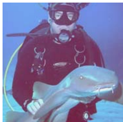
Don't try this at home— trained professionals only

Mating generally occurs in the summer months with the female sharks giving birth late in the year to broods typically of 30-40 sharks. At birth the Nurse shark is 11-12 inches in length and grows at rates of about 5 inches and 5 lbs per year. The average length and weight of the larger female Nurse shark is 7.5 to 9 feet and up to 270 lbs.